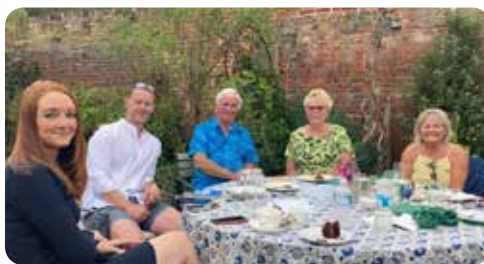
Afternoon Tea Fundraising