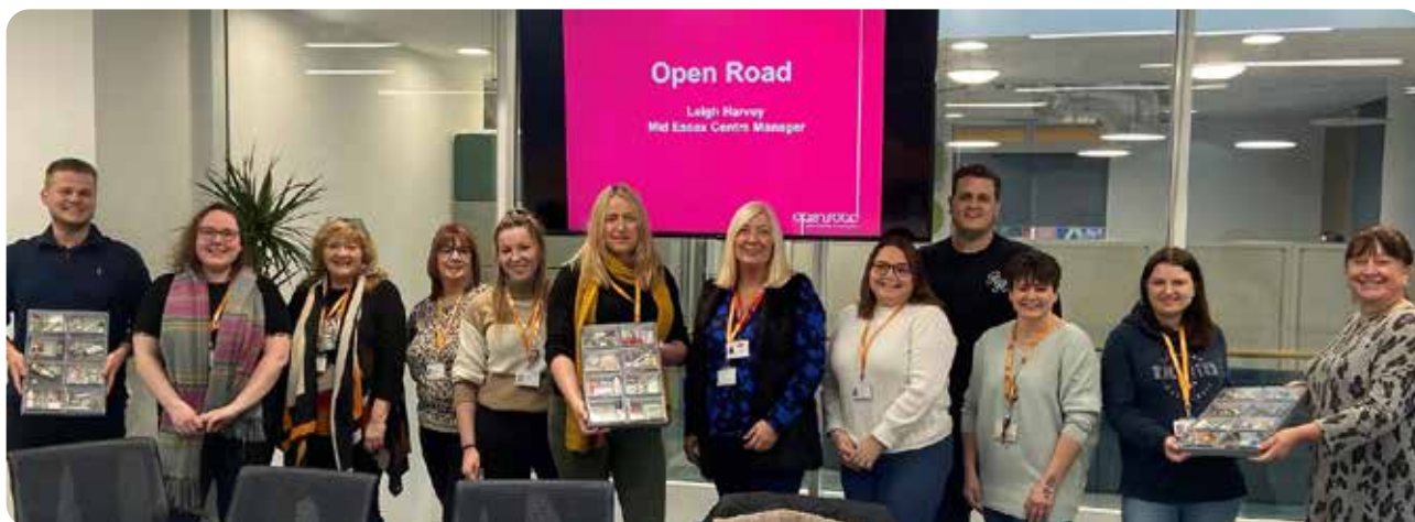
Leigh training session

As part of our charity's work, we offer training to partners and businesses, to raise awareness of substance and alcohol misuse. The training benefits organisations in the voluntary sector as they support clients, and corporate businesses to identify and support staff who might be struggling in their day-to-day role, due to misuse.