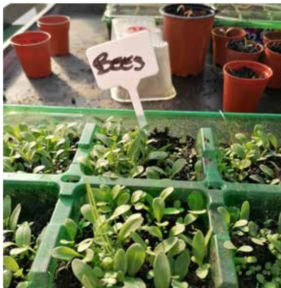
Bee food coming on nicely