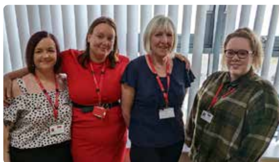
SOS Bus team in the house!