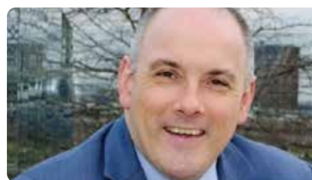
Robert Halfon, MP and Open Road Patron