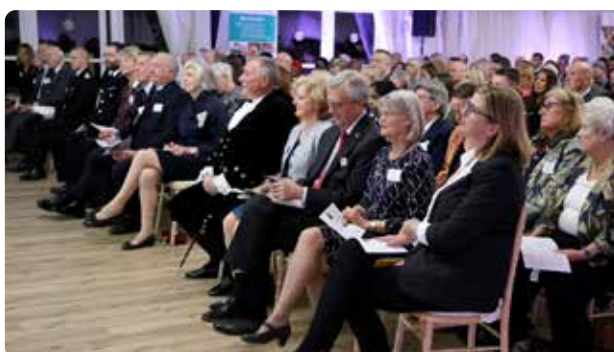
High Sheriff Awards Guests