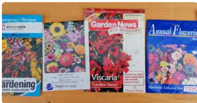
Seeds of Choice